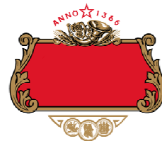
64 Stella Artois