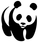
55 World Wildlife Fund